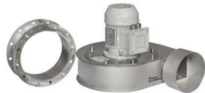
Upon request: fan support flange